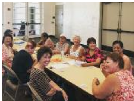
Senior Club Board Games