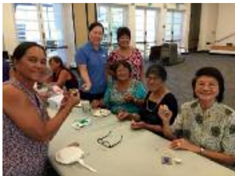
Senior Club Resin Craft Class

Mahalo to all our guest speakers and instructors! If you are 55 years or older, come join our Seniors Club on Thursdays at 10:00 a.m. We have lots of activities, games, seminars and field trips coming up this quarter. For more information, call the Rec Center at 674-4444 dept. 2.