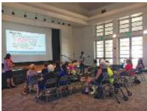
Senior Club Identity Theft Lecture